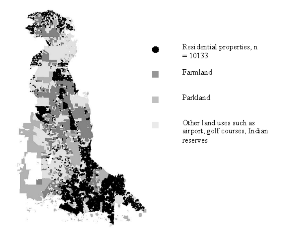
Figure 2: Land use and location of residential properties on the Saanich Peninsula